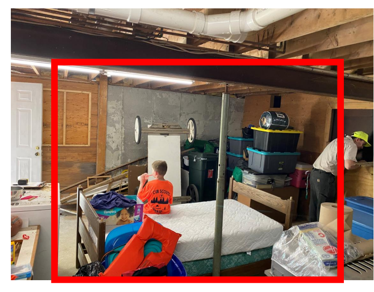
- Build and furnish 11' x 14' Radio Room