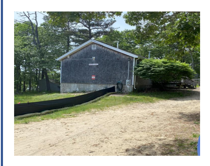
- Cleanup and organize basement